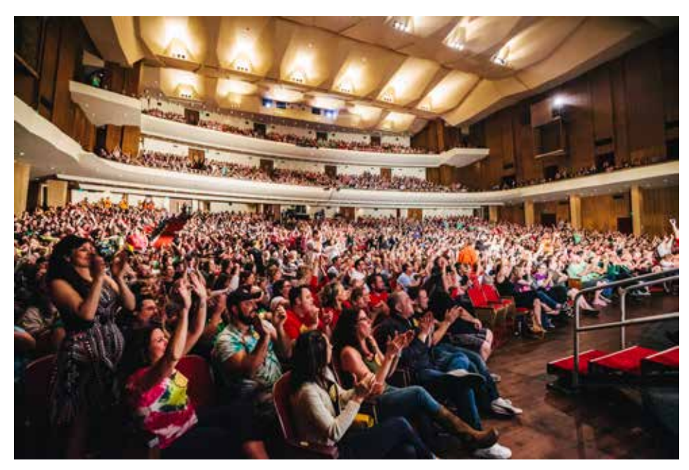
Tens of thousands of patrons visit PORTLAND'5 venues each year.